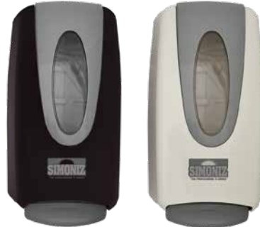
Black | DAA501501 White | DAA501401