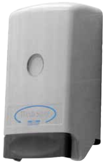
BAG-IN-BOX DISPENSER Item# DAADISP#1