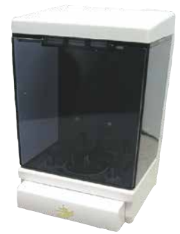
BULK DISPENSER Item# IMP3311