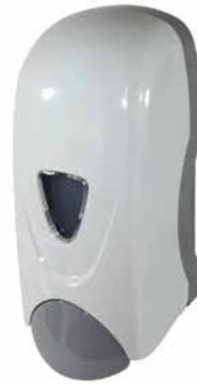
IMPACT FOAM EZ Item# 9325